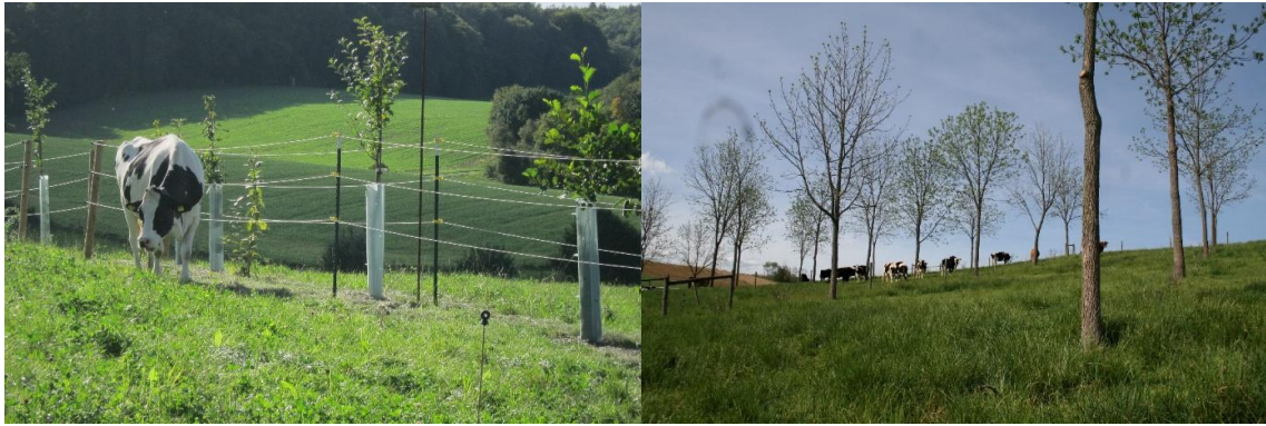
Figure 2: Young silvopastoral system. (left); Silvopastoral system with twenty-year-old black walnut trees. (right)

Note: Further pictures were shown to respondents.