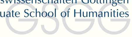
Funding and Qualification 2011-2021